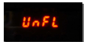
Under- and overflow indication